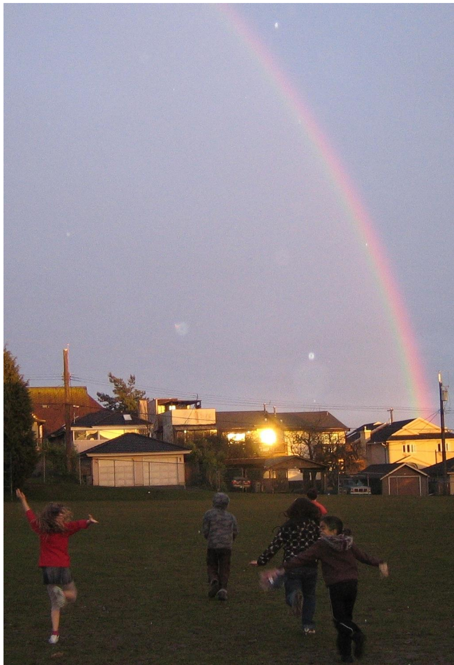
Backfield rainbows are rare.