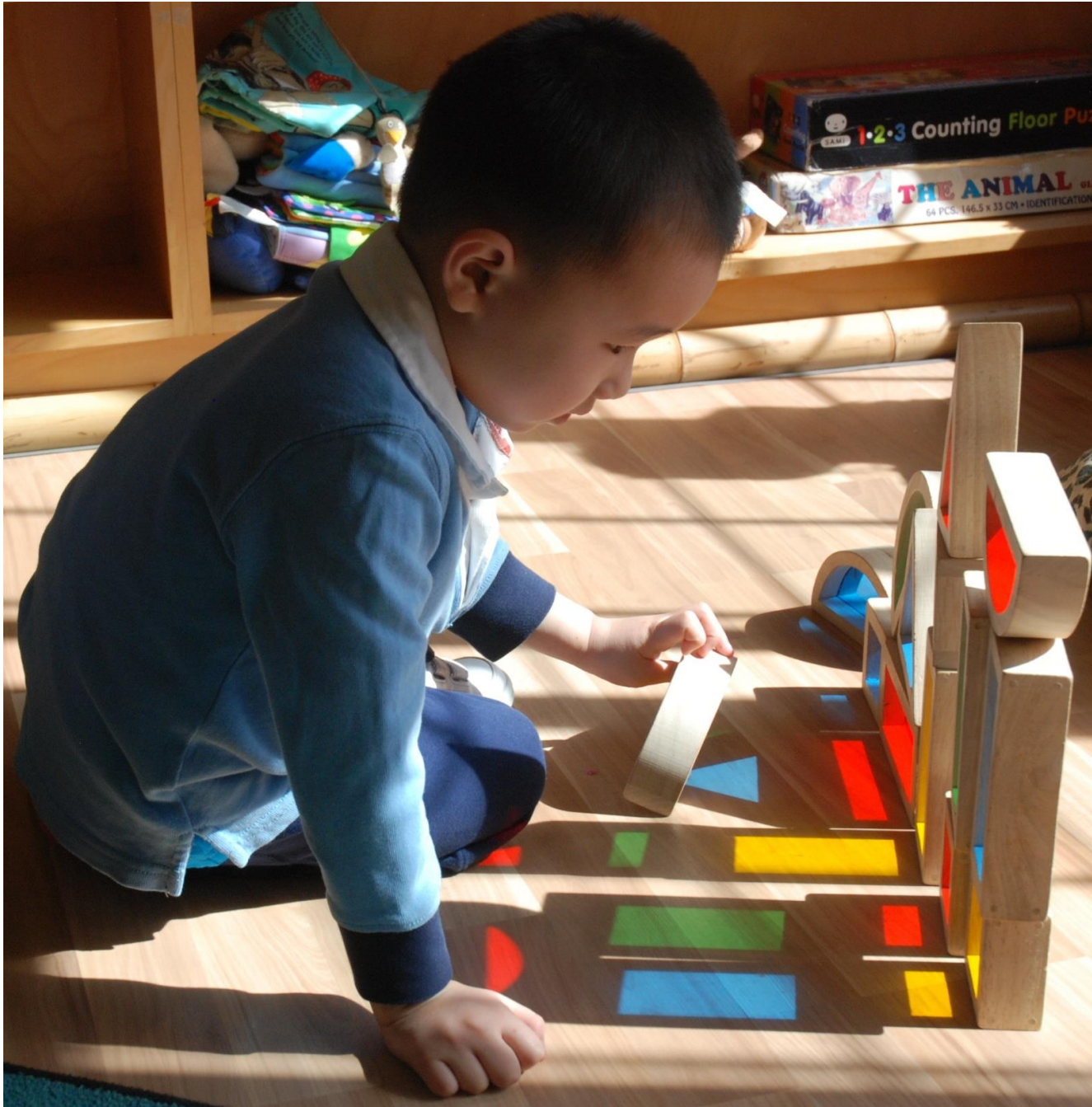
Some built with “stained glass” blocks near a window full of morning sun.