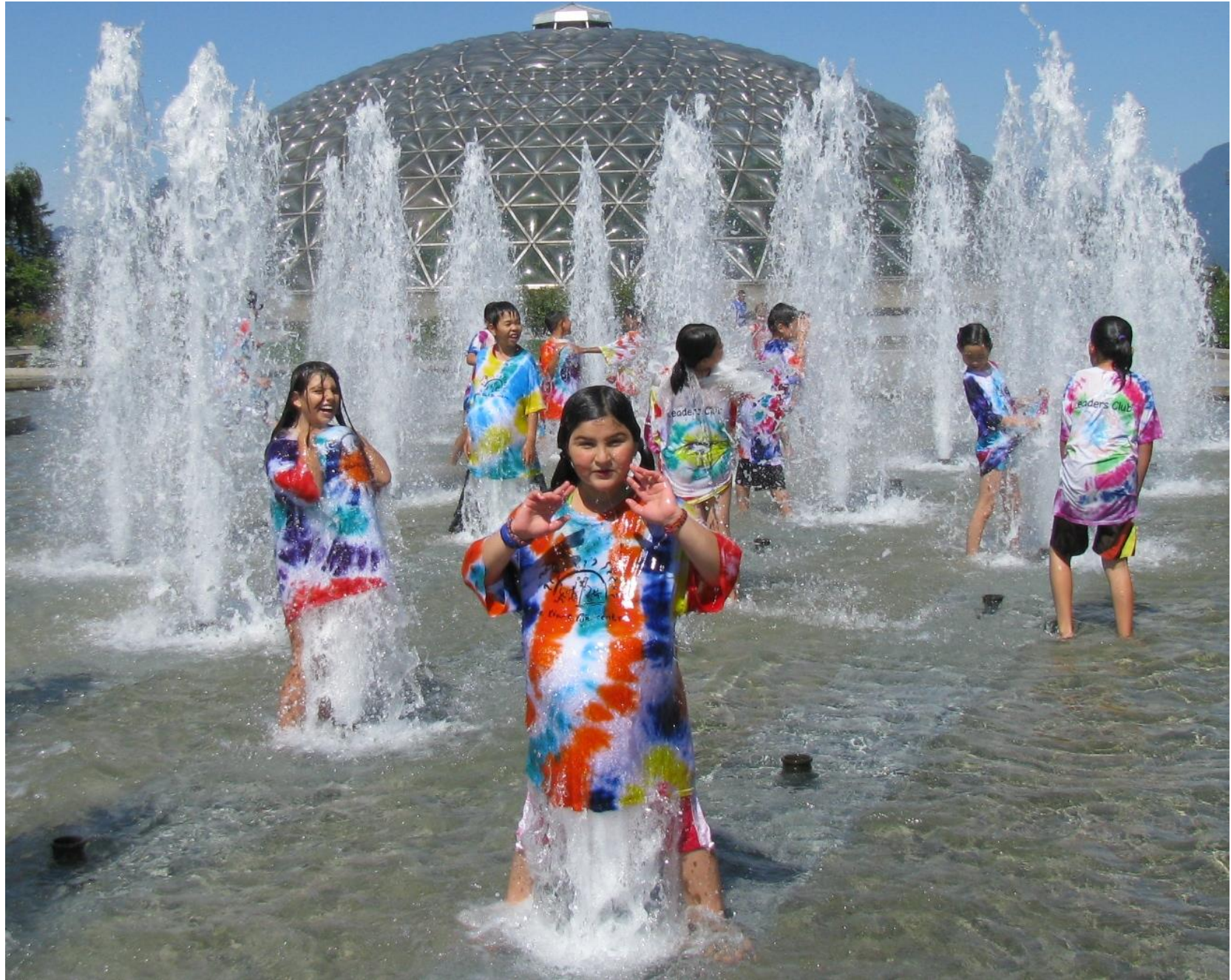
A group in our tie-dyed field trip T-shirts created its own water park rainbow...