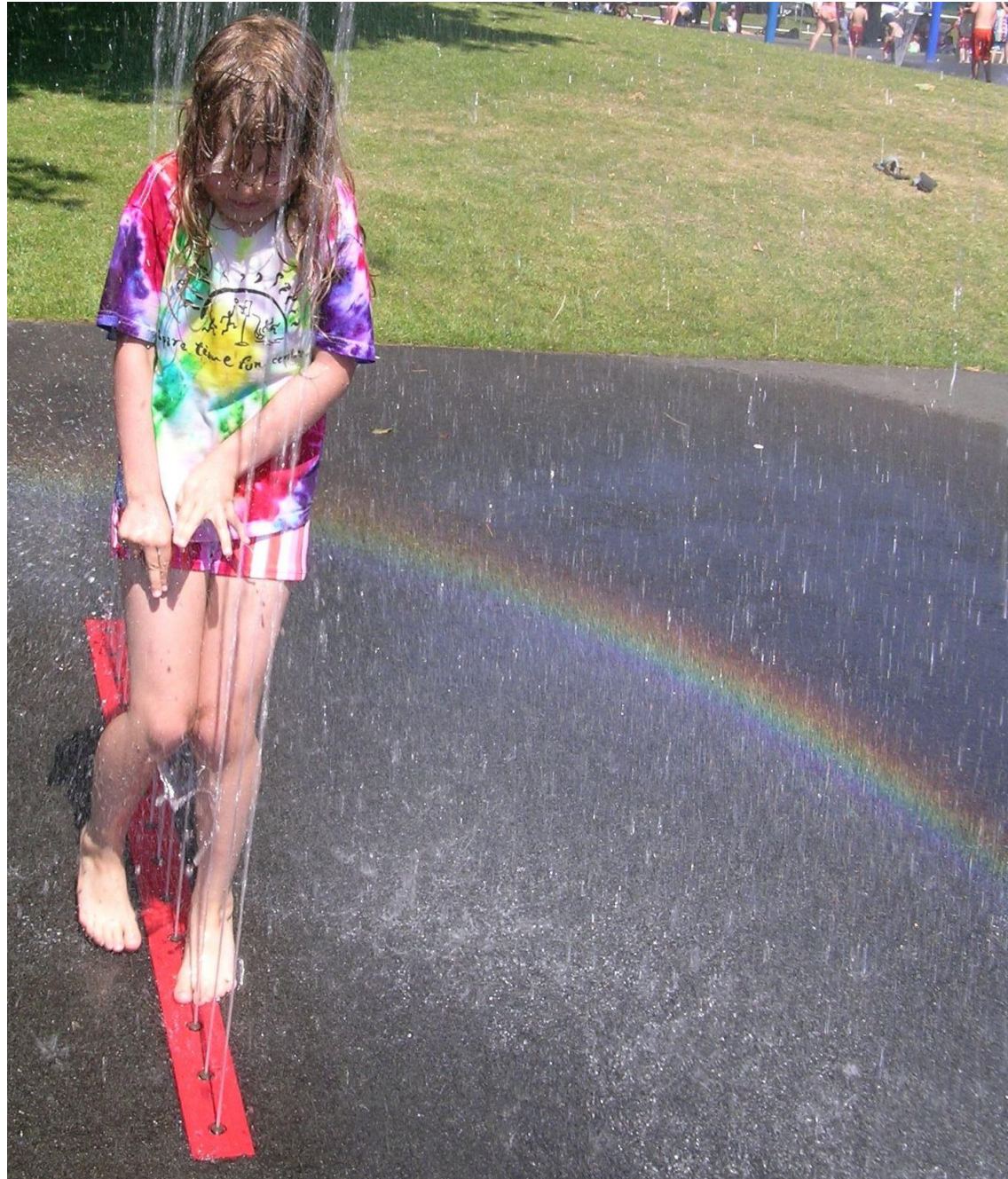
Water park rainbows only show up in the summer.